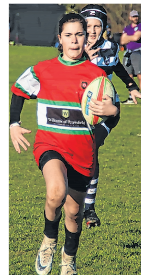
A Petersfield player runs with the ball.