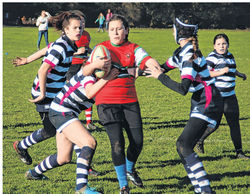
Action from the girls' rugby festival at Penns Place.

For more information email Pam Cheeseman at: pam@dowers.biz