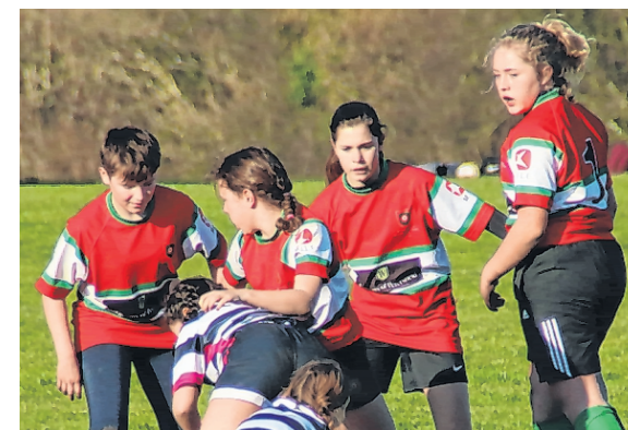
Nine clubs took part in the girls' rugby festival which was held at Petersfield RFC.