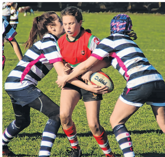
The sun shone for the girls' rugby festival and those who took part enjoyed their matches.