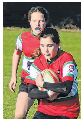
Petersfield players in action at the festival.